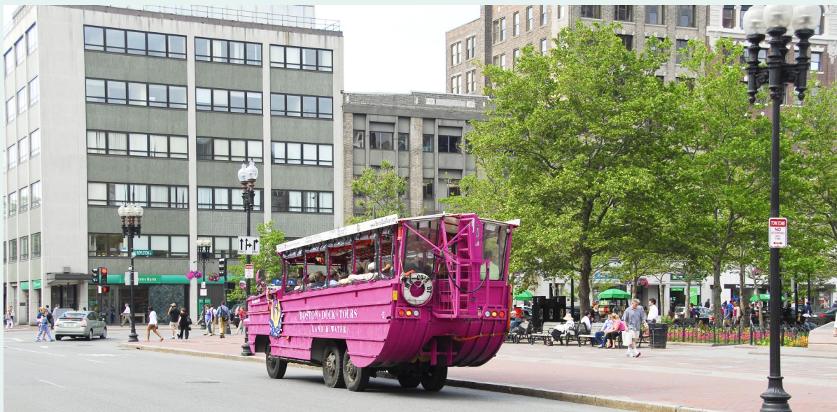
Ducks are a common sight on Boston's streets and waterways.

He also sees this as a significant growth area for the company. With the bringing on of MIT, the company expects to do more business in the Cambridge (MA) area. What's more, the city of Boston has an initiative to have its public transportation "clean burning." So in regards to transit in the city, he sees additional market opportunities.