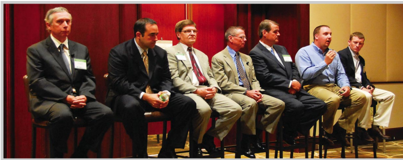
The Waltham meeting was concluded with an interactive panel of Massachusetts wholesale distributors, who fielded questions from the audience.