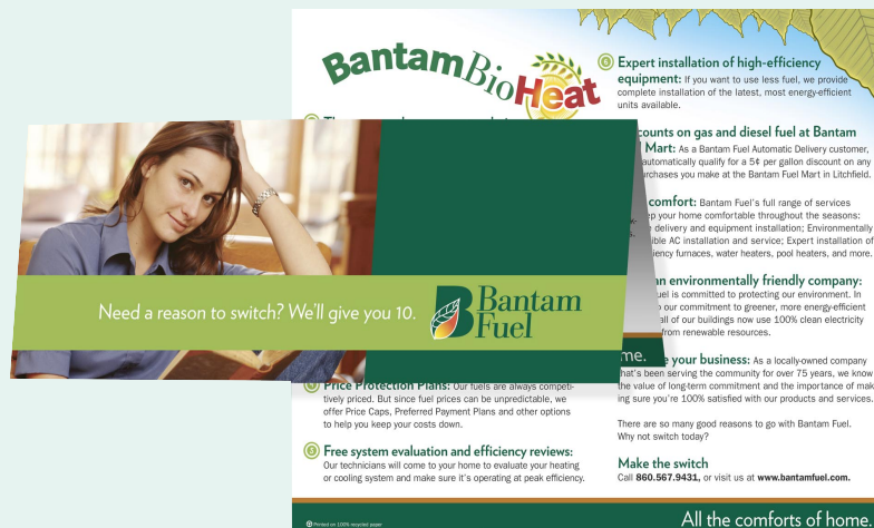
This mailer gives a prospective customer 10 good reasons to switch to Bantam BioHeat.

And yes, the company is now using more green ink. Bantam developed a new logo, with a leaf on it. In fact, the logo was so new that during a small press conference announcing the first delivery of Bioheat®, only one side of their truck was emblazoned with the new graphics. Every local politician and even the state's senators were invited. To their delight, Senator Joe Lieberman showed up, followed by the press. To get around the fact that they only had one logo on the truck at the time, it was parked